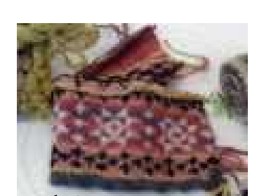
Fair Isle Spinning, & Knitting 5/30 - 6/3, 2018