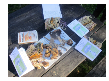
Mushroom Dyeing 9/16, 2018