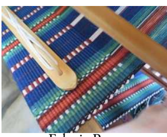
Ethnic Rugs 6/23 & 24, 2018