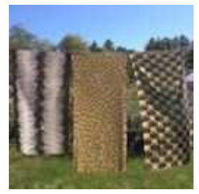
Printing Extravaganza 8/13 - 24, 2018