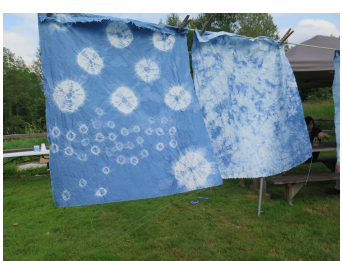
Japanese Shibori 7/7 & 8, 2018