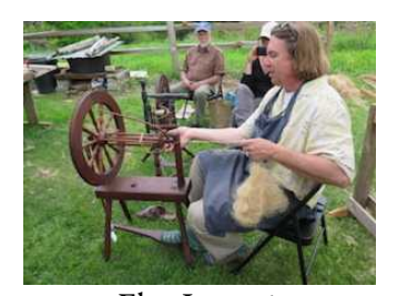
Flax Intensive 7/14 - 16, 2018